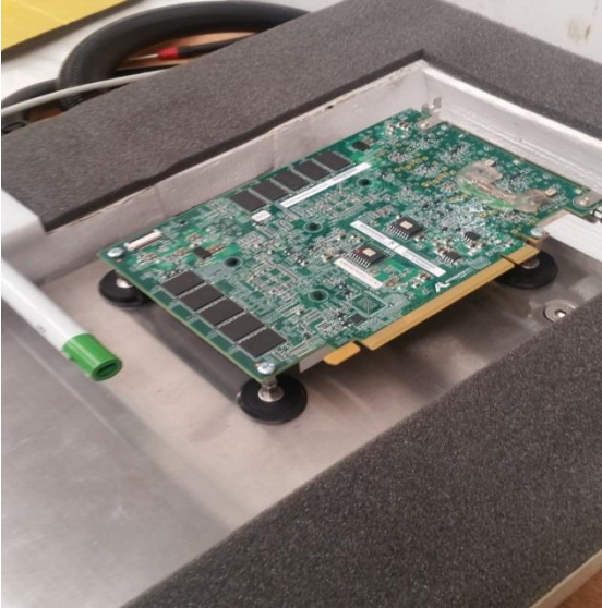
PCB under test with Air flow sensor